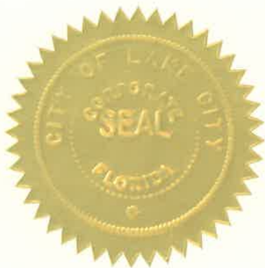
Seal of the City of Lake City State of Florida