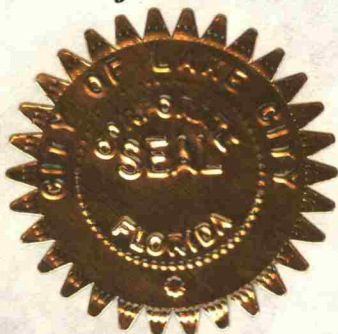
Seal of the City of Lake City State of Florida

NOW, THEREFORE, I, Stephen M. Witt, Mayor of the City of Lake City, Florida, do hereby extend the State of Emergency due to the COVID-19 health concerns for an additional seven (7) days effective December 29, 2020.