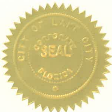
Seal of the City of Lake City State of Florida