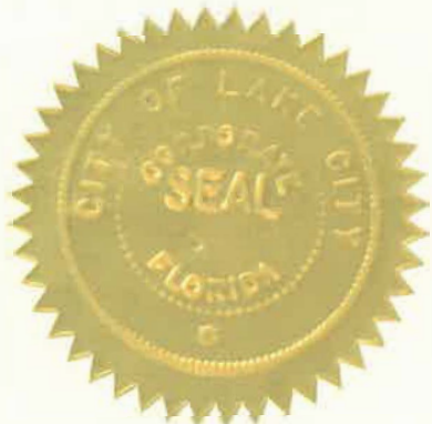
Seal of the City of Lake City State of Florida