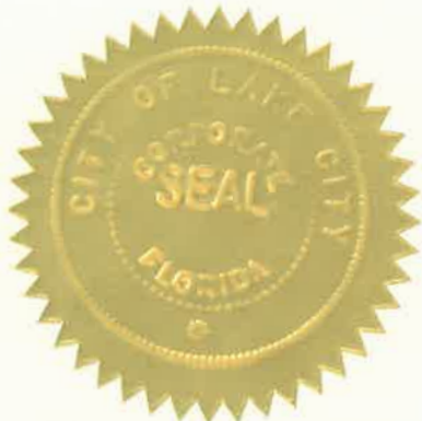
Seal of the City of Lake City State of Florida

I further call upon all citizens of the City of Lake City to observe, Wednesday, May 15, as Peace Officers' Memorial Day in honor of those law enforcement officers who, through their courageous deeds, have made the ultimate sacrifice in service to their community or have become disabled in the performance of duty, and let us recognize and pay respect to the survivors of our fallen heroes.