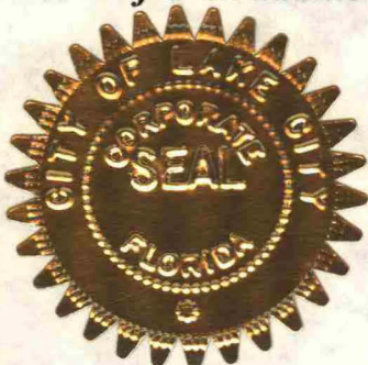
Seal of the City of Lake City State of Florida

NOW, THEREFORE, I, Stephen M. Witt, Mayor of the City of Lake City, Florida, do hereby extend the State of Emergency due to the COVID-19 health concerns for an additional seven (7) days effective February 23, 2021.