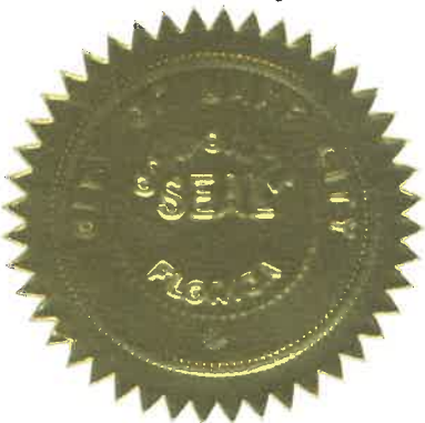
Seal of the City of Lake City State of Florida

NOW, THEREFORE, I, Stephen M. Witt, Mayor of the City of Lake City, Florida, do hereby proclaim April 9-15, 2023 as “ National Public Safety Telecommunicators Week ” in the City of Lake City, and do hereby recognize the Lake City Public Safety Telecommunicators for their outstanding service and commitment to the citizens of Lake City and Columbia County.