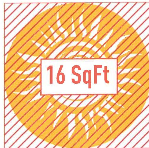
SUN ICON ASSEMBLY - AREA CALCULATION