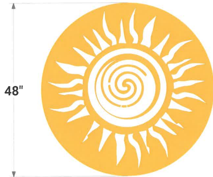
SUN ICON ASSEMBLY - DIMENSIONS