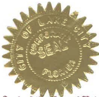
Seal of the City of Lake City State of Florida