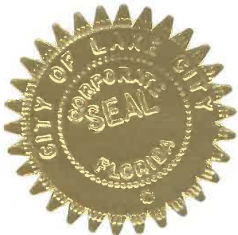
Seal of the City of Lake City State of Florida

NOW, THEREFORE, I, Stephen M. Witt, Mayor of the City of Lake City, Florida, do hereby extend the State of Emergency due to the COVID-19 health concerns for an additional seven (7) days effective June 15, 2021.