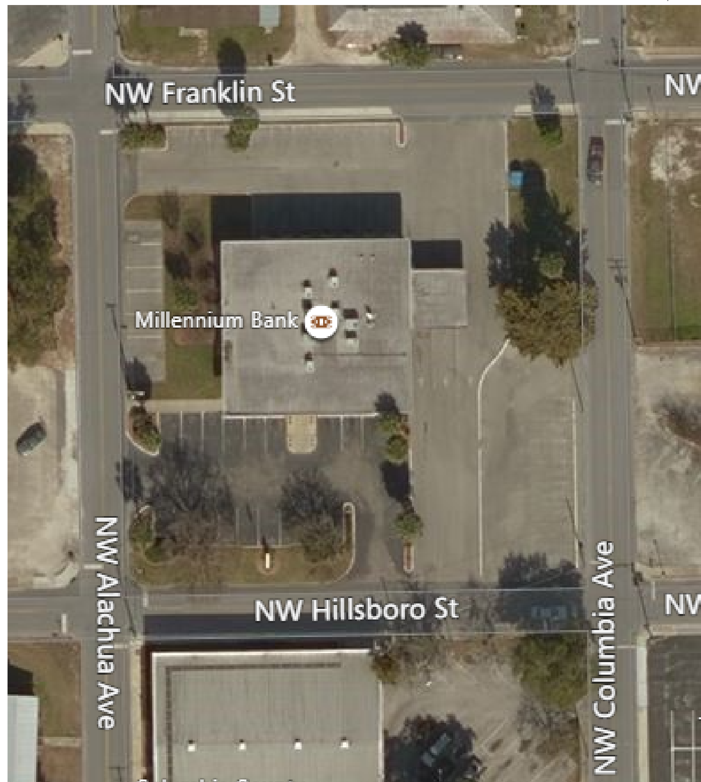
NEIGHBORHOOD AERIAL VIEW