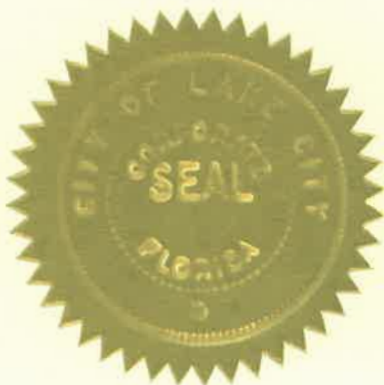
Seal of the City of Lake City State of Florida

NOW, THEREFORE, I, Noah Walker, Mayor of the City of Lake City, Florida do hereby proclaim April as "Water Conservation Month" and urge each citizen and business to help protect our precious resource by practicing water saving measures and becoming more aware of the need to save water.