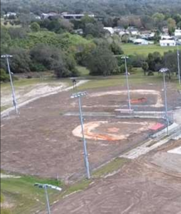
Majors and Softball January 2024