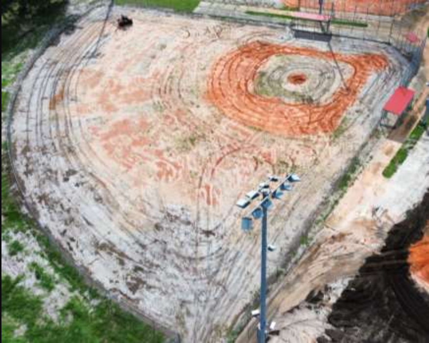
Majors Field June 2024