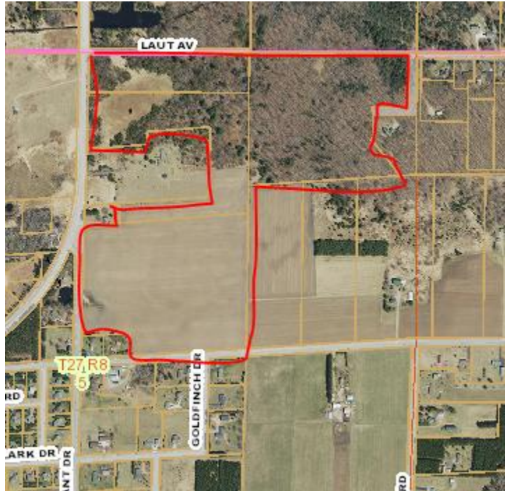
2020 AERIAL PHOTO

Current Zoning: SF (Single Family Residential)