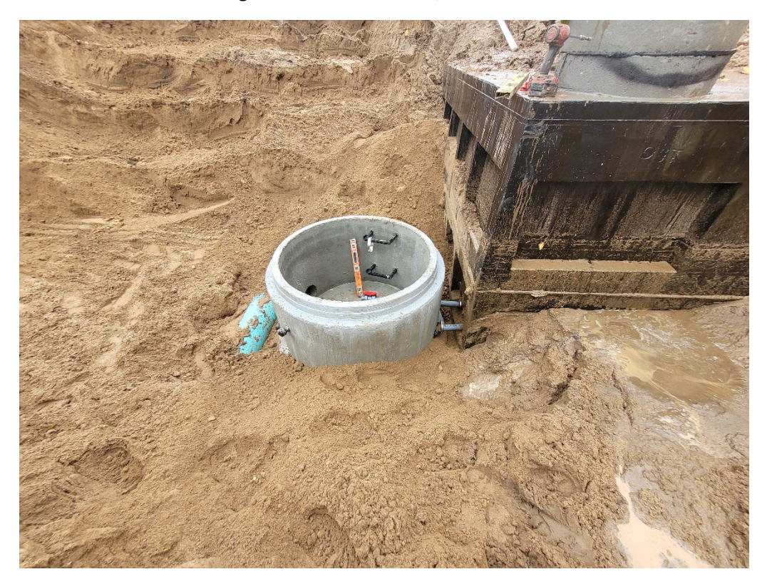
Underground backwash tank discharge manhole