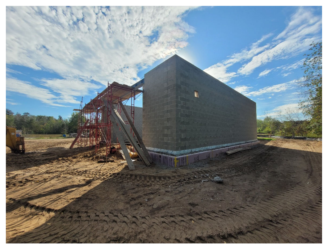
8" Concrete Masonry Unit Wall, at northeast corner