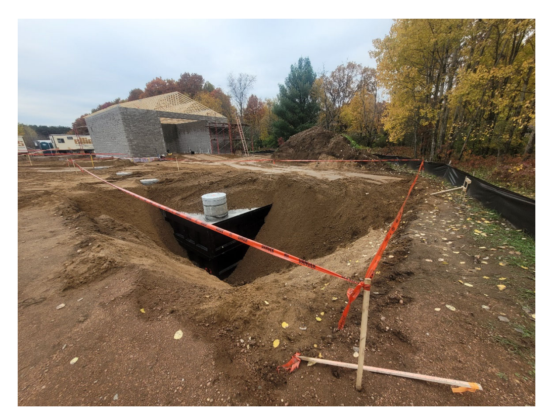
Underground tanks backfilled, trusses installed