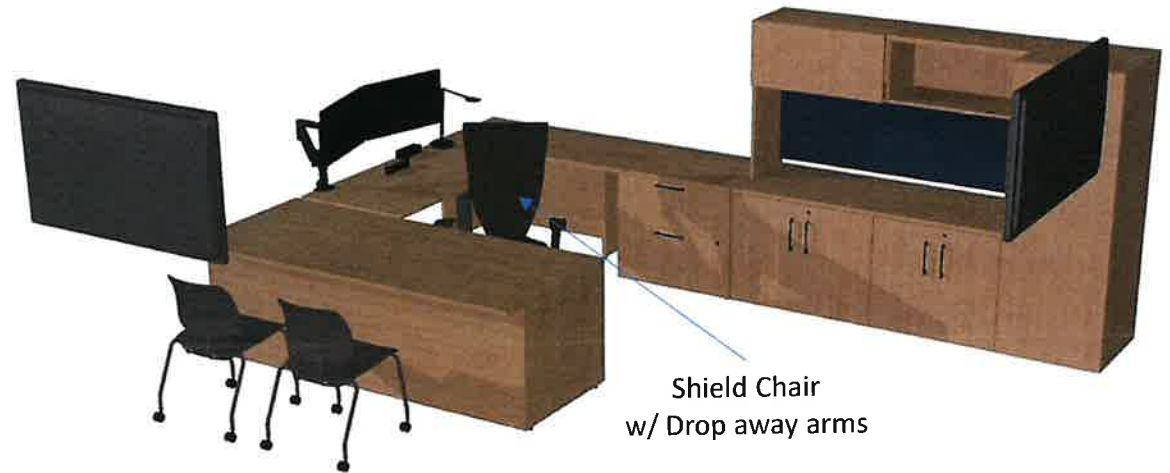
Shield Chair w/ Drop away arms