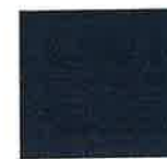
Buzz 2 Navy