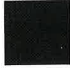
Black Ballistic Nylon