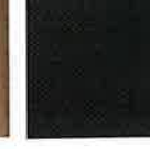
Black Ballistic Nylon