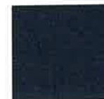
Buzz 2 Navy