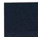
Buzz 2 Navy