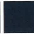
Buzz 2 Navy