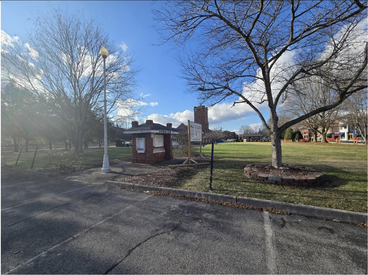
135 Main Street Northern View