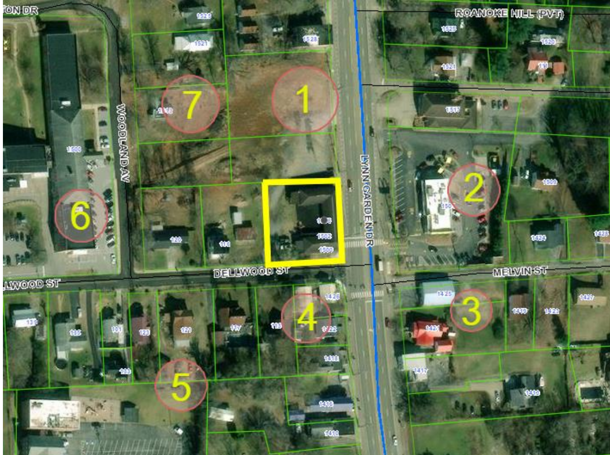
Existing Zoning/ Land Use Table