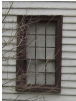
Original nine-over-six wood-sash window at the Netherland Inn.

Retaining as much of the historic window material and detail as possible will help protect the building's historic character and appearance. Replace only those elements necessary. Use epoxy to strengthen deteriorated wood.