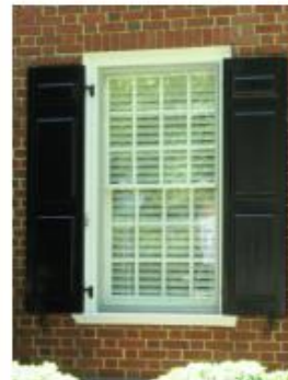
The original twelve-over-twelve, wood sash window at 1261 Watauga Street reflects the dwelling's Colonial Revival style.