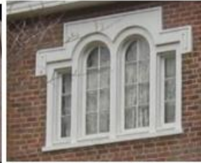
Rotherwood features this variation of a Classical Palladian window.