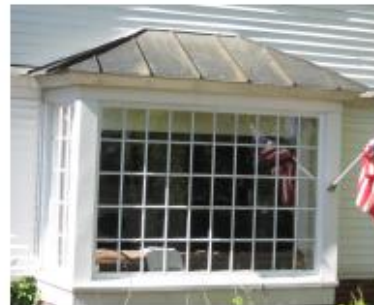
Above: Original multi-light window at 701 Yadkin Street.