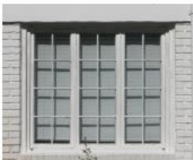
Original casement windows at 809 Yaddin Street.