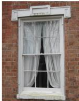
This original six-over-six, wood-sash window with ornamental hood is an important component of Rotherwood.