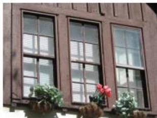
Original four-over-four, wood sash windows at 205 Compton Terrace.