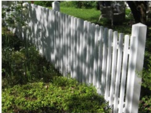
Appropriate height and design picket fence at 709 Yadkin Street.

For privacy in back yards, wood fences may be installed up to 7' in height or 6' with 2' with a framed lattice top. Wood supports measuring 4" by 4" or metal pipe are recommended. Privacy fences should be set back from the main façade by at least one-third of the total depth of the house. Maintain the fence with regular painting. Living fences, such as hedges or other landscaping, are attractive alternatives to chain-link or privacy fences.