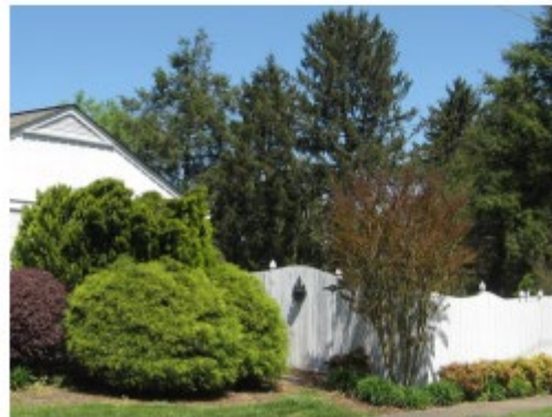
This appropriate privacy fence at 1154 Watauga Street surrounds the rear yard and is set back from the front of the house.