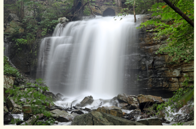
Dolan Branch Falls

Bays Mountain Park is a 3,750 acre nature preserve and state natural area. It is the largest municipal park in the state. Bays Mountain was historically used by Native Americans as a hunting ground. The first Europeans settled in the area in the late 1700s. Family farms dominated the landscape until construction of the reservoir in 1916, which served as Kingsport's drinking water supply until 1944. For over 100 years, families visited Bays Mountain for outdoor recreation and a connection to nature. In 1965 Kingsport began exploring options for permanently protecting this public use by creating a city park. This effort culminated in the opening of the Nature Center and the dedication of the park in 1971. Since that time, the park has continued to grow in size and resources. With a planetarium, nature center, native animal exhibits and a barge on the reservoir, the park focuses much of its resources on science education. An extensive hiking and biking trail system lends itself to outdoor recreation for all levels. The park's ecosystem is home to myriad plants and animals, big and small.