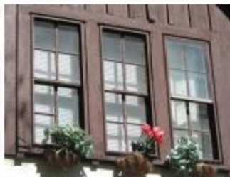
Original four-over-four, wood sash windows at 205 Compton Terrace.