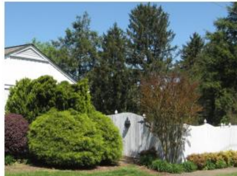
This appropriate privacy fence at 1154 Watauga Street surrounds the rear yard and is set back from the front of the house.