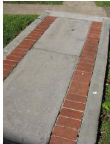
Concrete walk with inlaid brick at S10-S12 Yadkin Street.