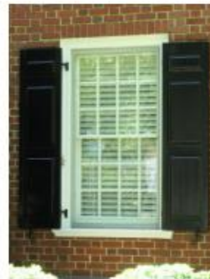
The original twelve over-twelve, wood sash window at 1261 Watauga Street reflects the dwelling's Colonial Revival style.