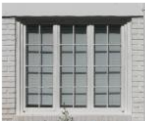
Original casement windows at 809 Yadkin Street.