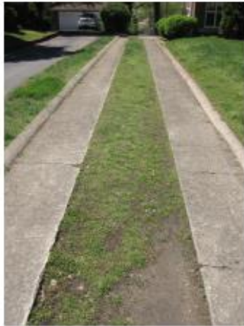
Original concrete ribbon driveway at 1301 Watauga Street.

New outbuildings should blend with the architectural style of the primary dwelling. Site them at appropriate locations, such as to the rear of a house or recessed back from the side elevations.