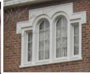
Rotherwood features this variation of a Classical Palladian window.