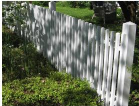
Appropriate height and design picket fence at 709 Yadkin Street.

For privacy in back yards, wood fences may be installed up to 7' in height or 6' with 2' with a framed lattice top. Wood supports measuring 4" by 4" or metal pipe are recommended. Privacy fences should be set back from the main façade by at least one-third of the total depth of the house. Maintain the fence with regular painting. Living fences, such as hedges or other landscaping, are attractive alternatives to chain-link or privacy fences.