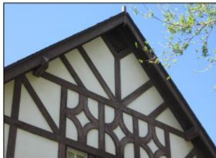
Stucco is a significant primary material in the Park Hill Historic District and this surface should be preserved and maintained (217 Hammond Avenue).

Remove paint from stucco and concrete with appropriate chemical agents and professional contractors. A test patch should be conducted first to ensure that no etching or staining of the wall surfaces will occur.