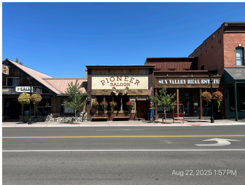
PIONEER SALOON FACADE