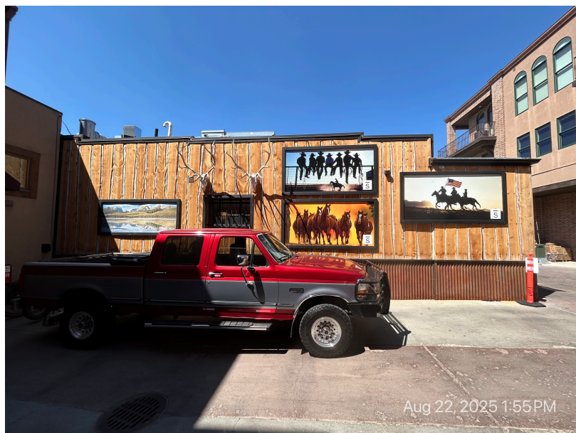
EXPOSED PORTION OF S. SIDE ELEVATION