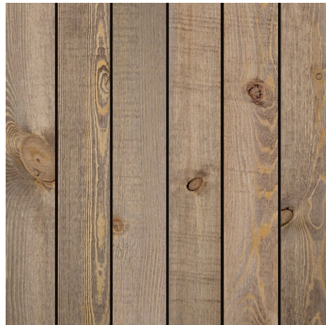
LEFT: DECORATIVE RECLAIMED LUMBER FOR COLUMNS AND BEAMS ABOVE: STAINED SIDING AROUND WINDOWS