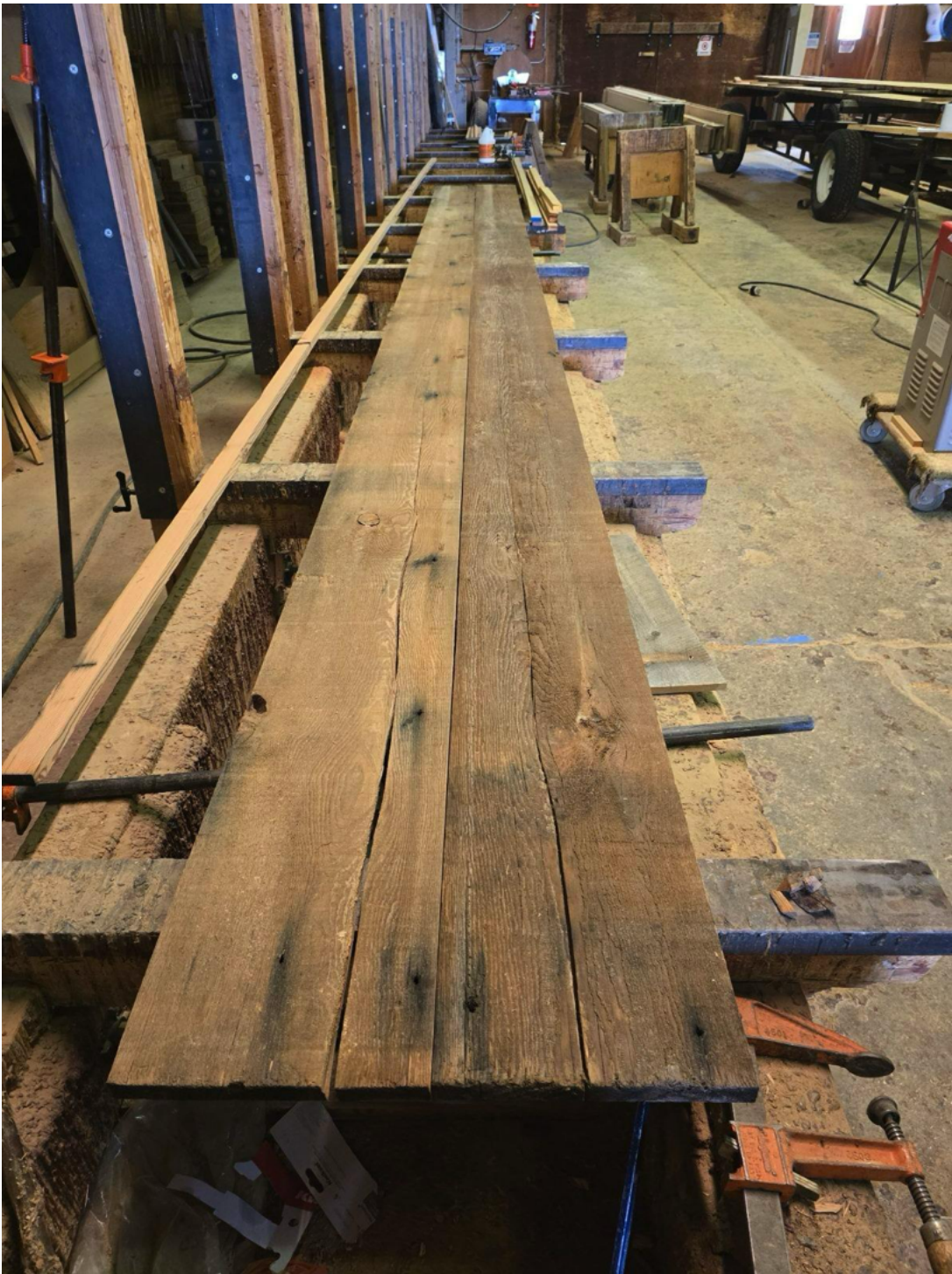
RECLAIMED BARN WOOD FOR PROPOSED DECORATIVE FRAMING