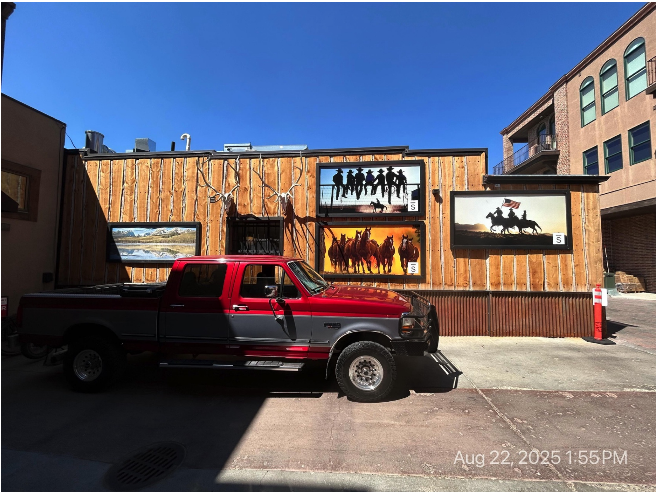
EXPOSED PORTION OF S. SIDE ELEVATION