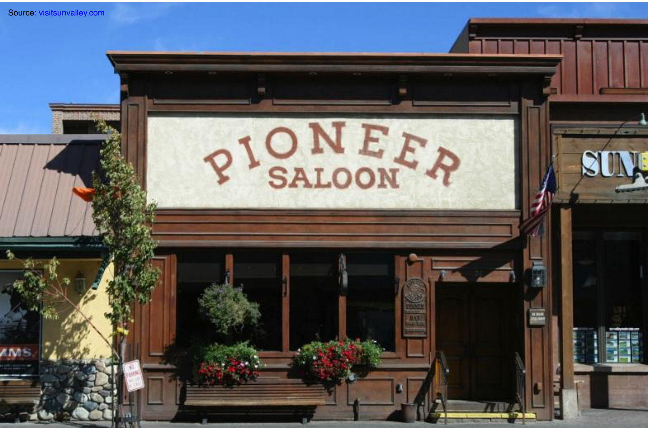
THE PIONEER SALOON AFTER ITS 2002 FACADE RENOVATION