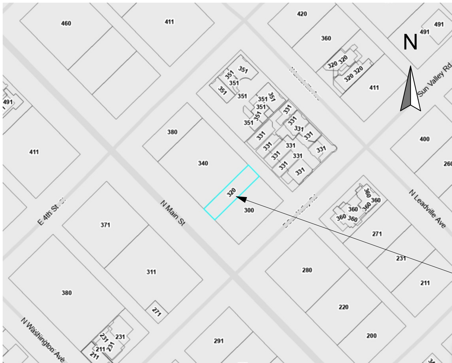
SITE VICINITY MAP PIONEER SALOON 320 N MAIN STREET

/Users/thomashowland/Documents/Job Files/2024 Job Files/2423 The Pioneer Saloon/The Pioneer.pln