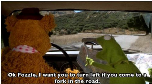
The Muppet Movie