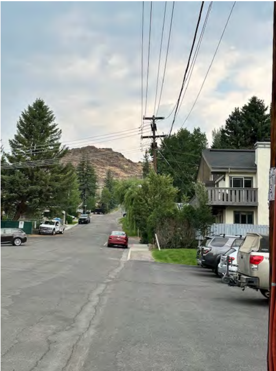
> > Spruce Street view >