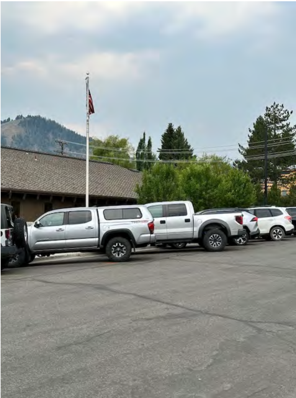
> > View from front of Community Library >