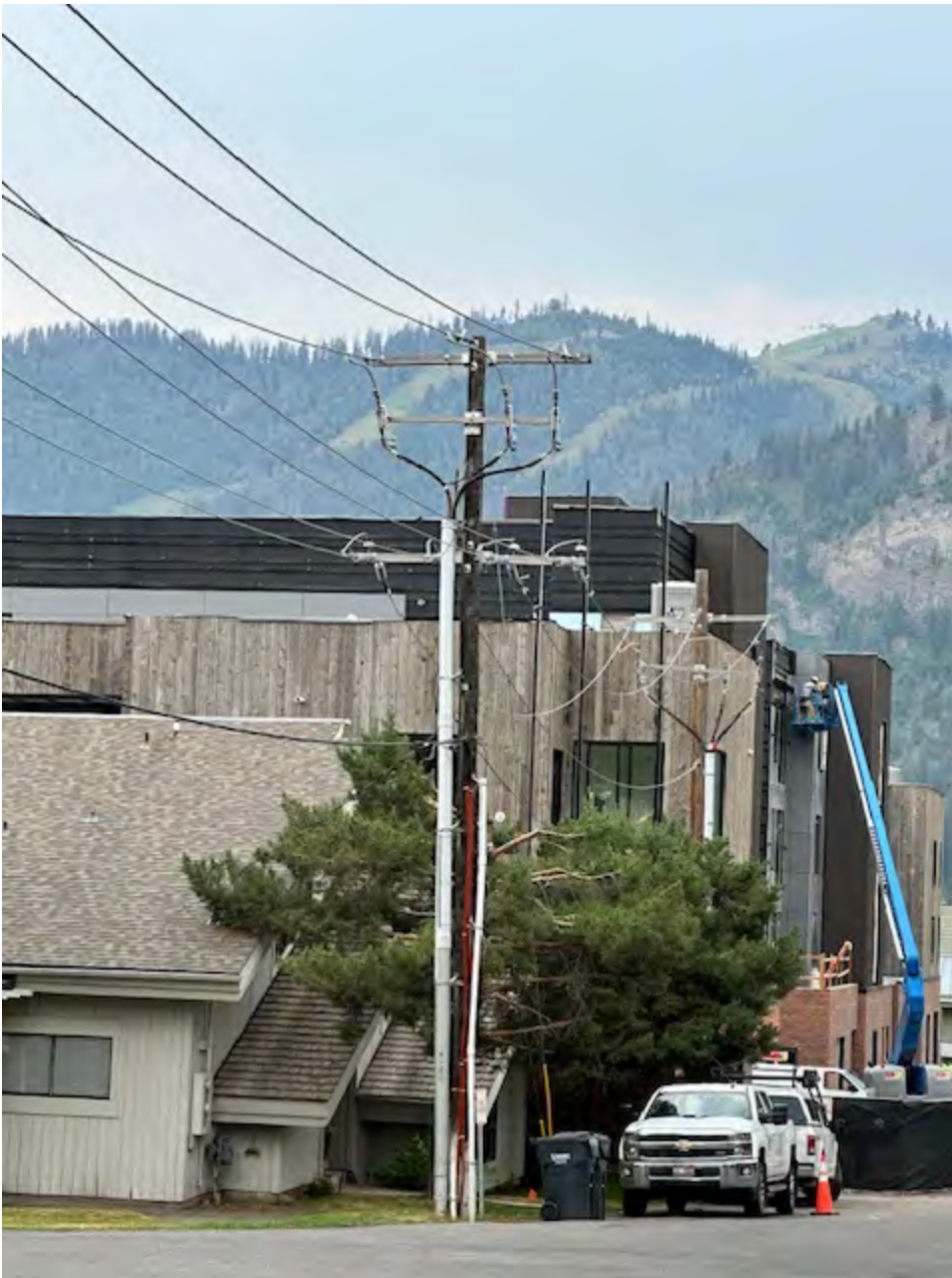
> Last pole. Sky marred for BlueBird.