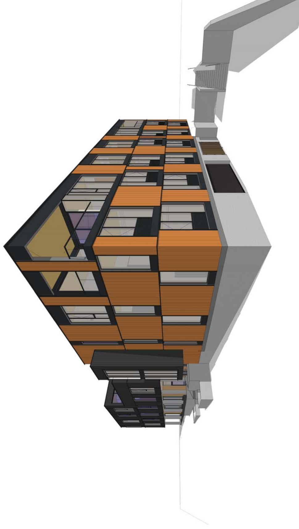
MATERIAL EXHIBIT VIEW FROM 4TH ST.