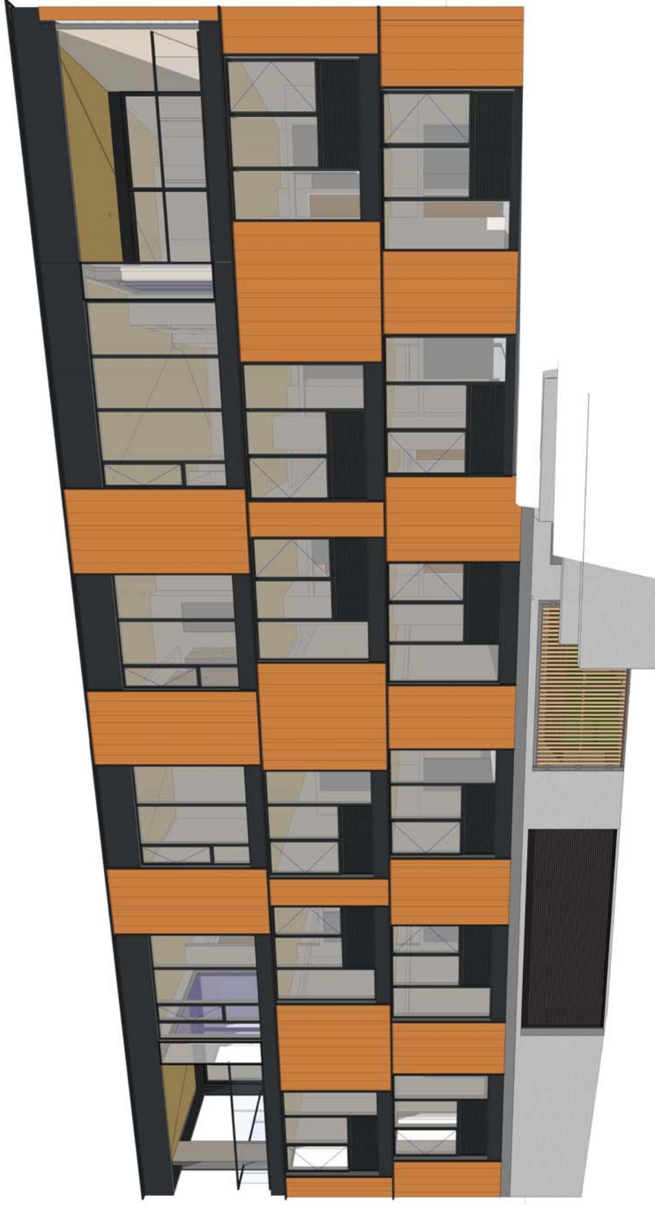
MATERIAL EXHIBIT VIEW FROM ALLEY