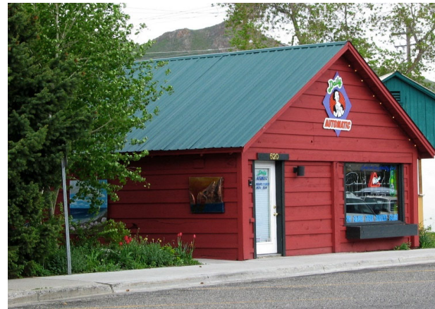
2005 Survey Photo