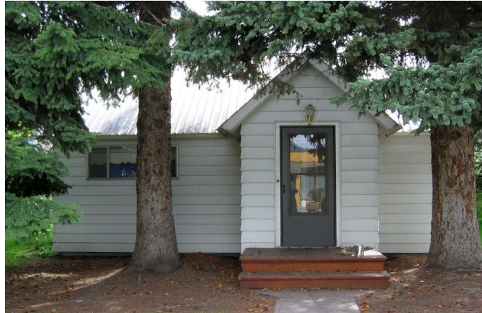
2005 Survey Photo