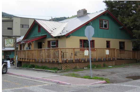
2005 Survey Photo