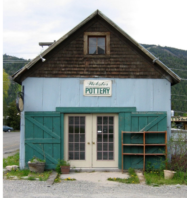
2005 Survey Photo