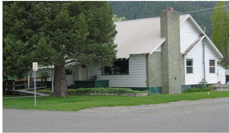
2005 Survey Photo