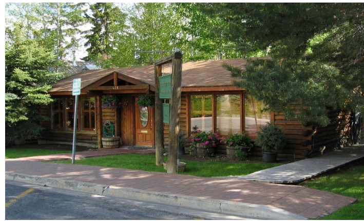
2005 Survey Photo