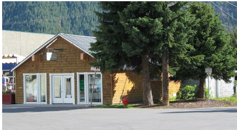
2005 Survey Photo

2006 Survey Notes Survey notes year built as 1915 None