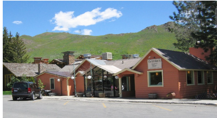
2005 Survey Photo