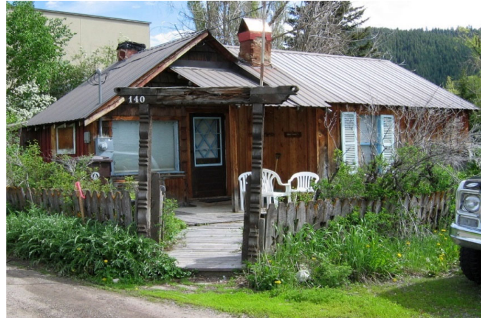
2005 Survey Photo

2005 Survey Notes: Description: 1 story wood frame & stucco house, shed with metal roofs. Tyrolean motifs on outside main residence walls Theme: Settlement