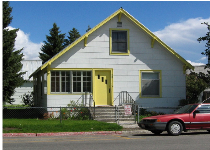
2005 Survey Photo