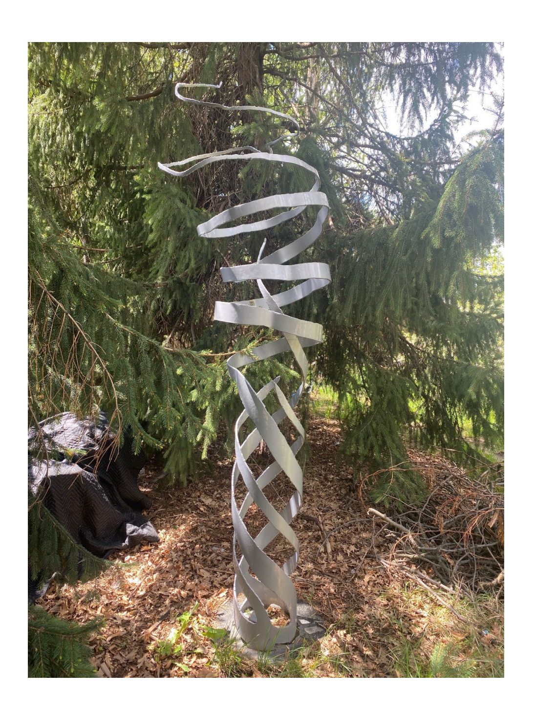
EXHIBIT A: Art on 4<sup>th</sup> D'Arcy Bellamy, Spiral Evolution