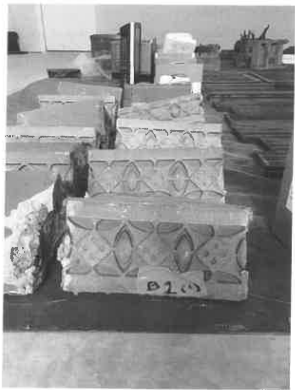
Personal sketch of Historic Building . Belgrade, MT