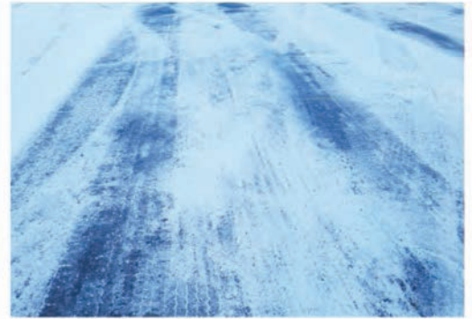
Bountiful, UT - December 2015 18°F - 4 minutes after plowing