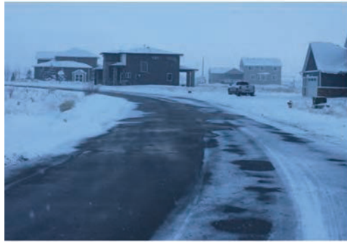
Kamas, UT - February 2018 3°F - City road melted with IceKicker

IceKicker's specially formulated additive kick starts the brining process helping cut snow and ice faster than before!