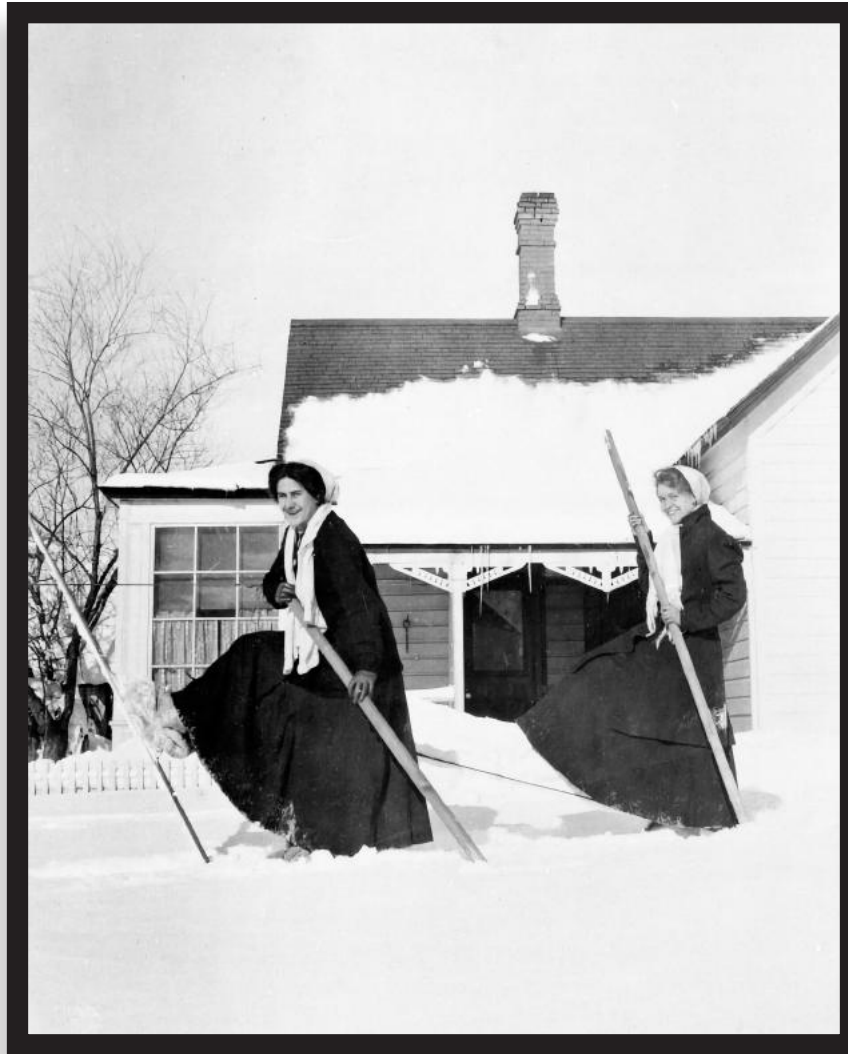
F 00857 / WOMEN SKIERS IN KETCHUM, CIRCA 1900 / 30" x 37"