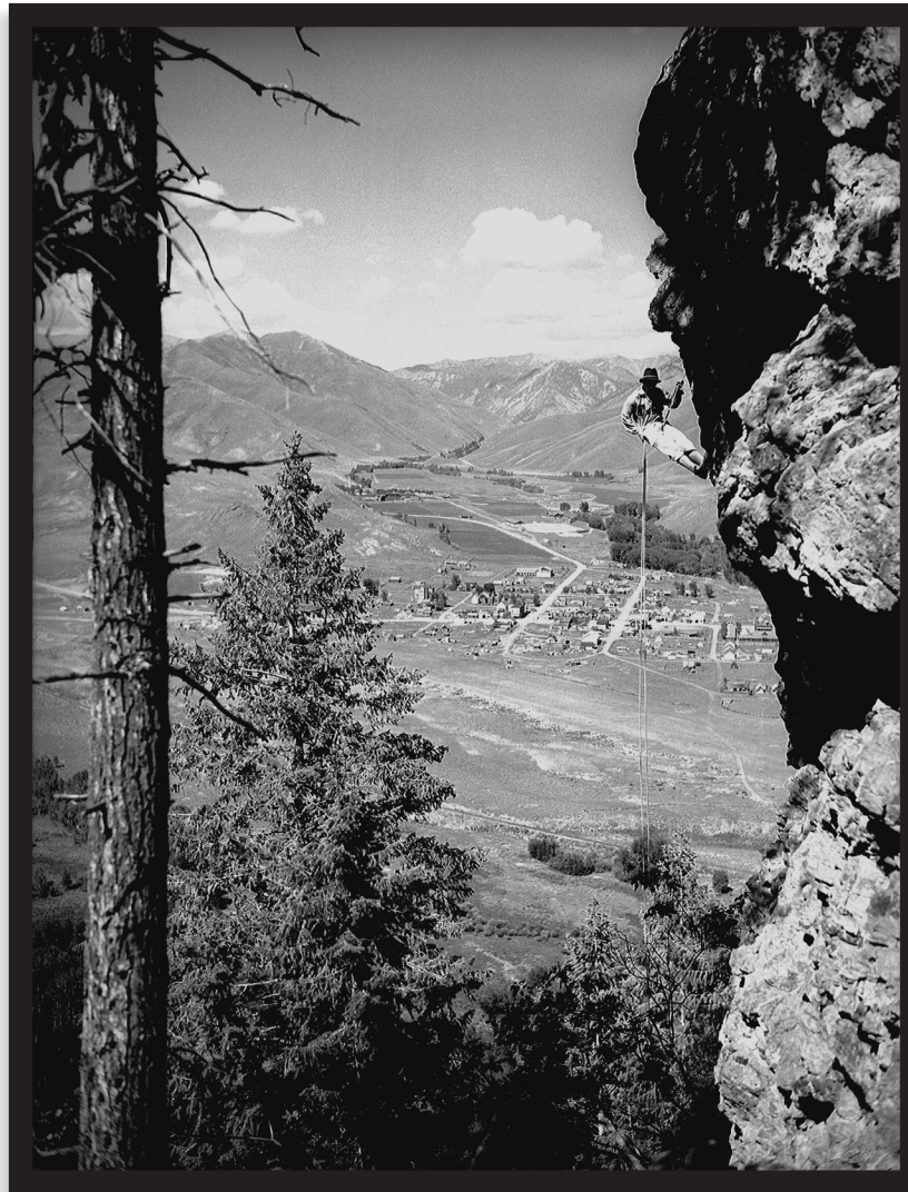
F 04830 / MOUNTAINEERING IN THE PIONEER MOUNTAINS, CIRCA 1940 / 44" x 58"