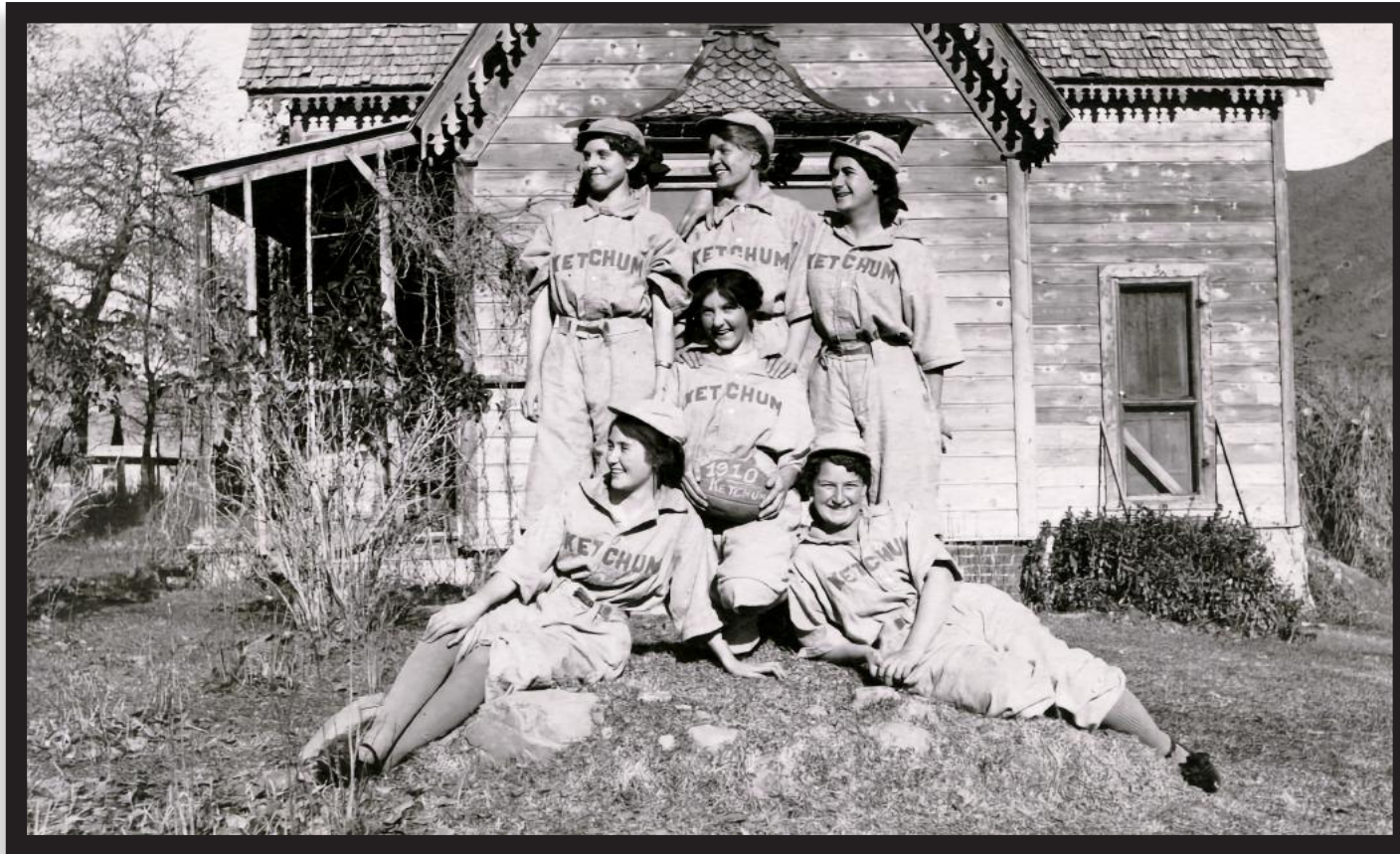
F 00069 / KETCHUM WOMEN'S FOOTBALL TEAM GROUP PHOTO IN FRONT OF DOLLARHIDE HOUSE / 42" x 25"