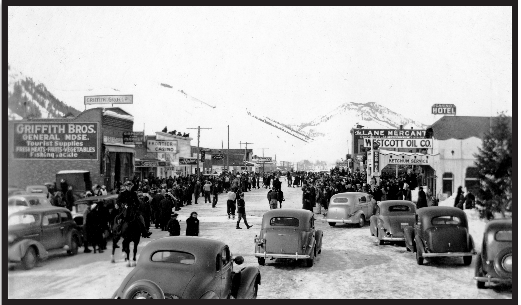
F 08422 / DOWNTOWN KETCHUM, WINTER / 82.5" x 48" Gold Mine Collection, Jeanne Rodger Lane Center for Regional History