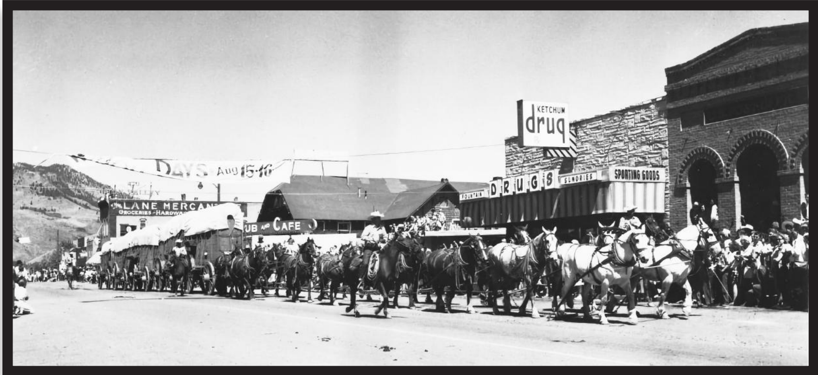
F 03927 / WAGON DAYS PARADE 1958 / 90" x 40"