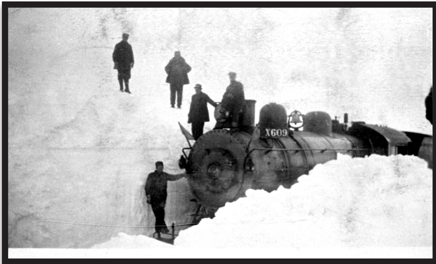
F 01480 / TRAIN FROM SHOSHONE TO KETCHUM / 48" x 29"