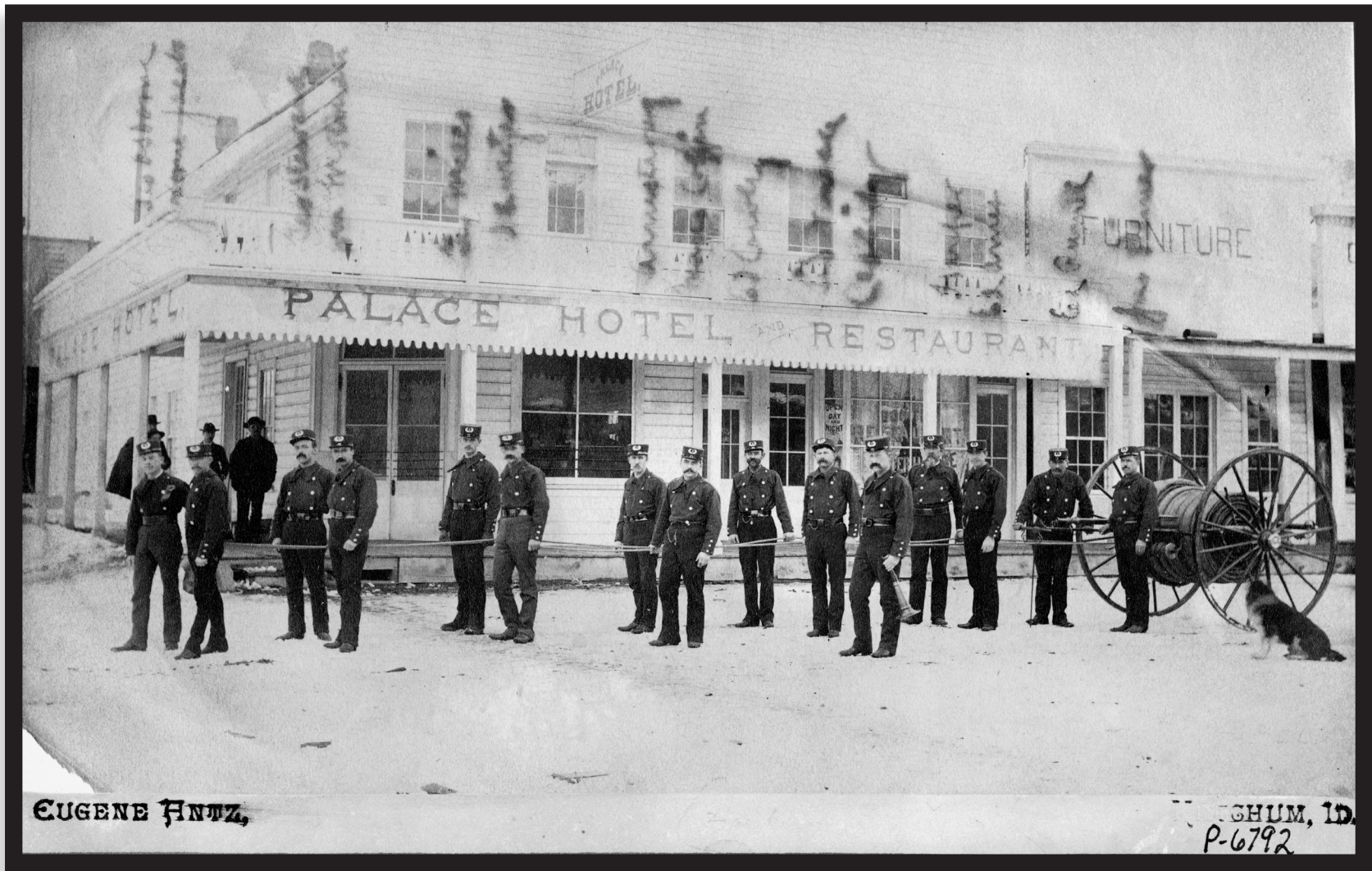
F 06113 / KETCHUM FIRE DEPARTMENT / 64" x 40"