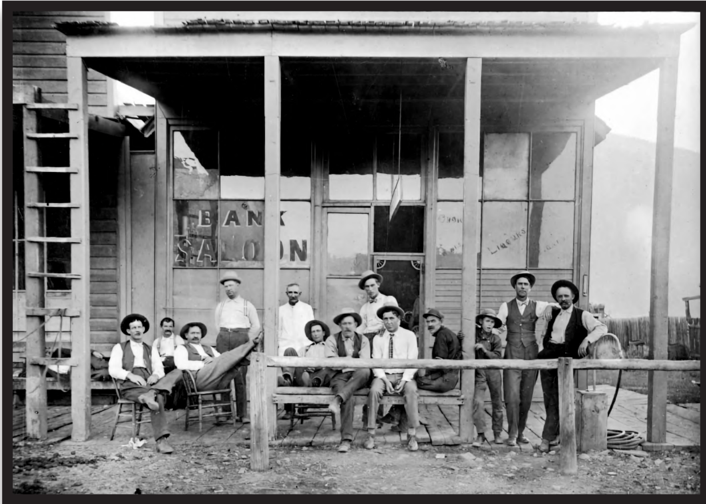
F 06816 / REID SALOON ON MAIN STREET, KETCHUM / 44" x 31"