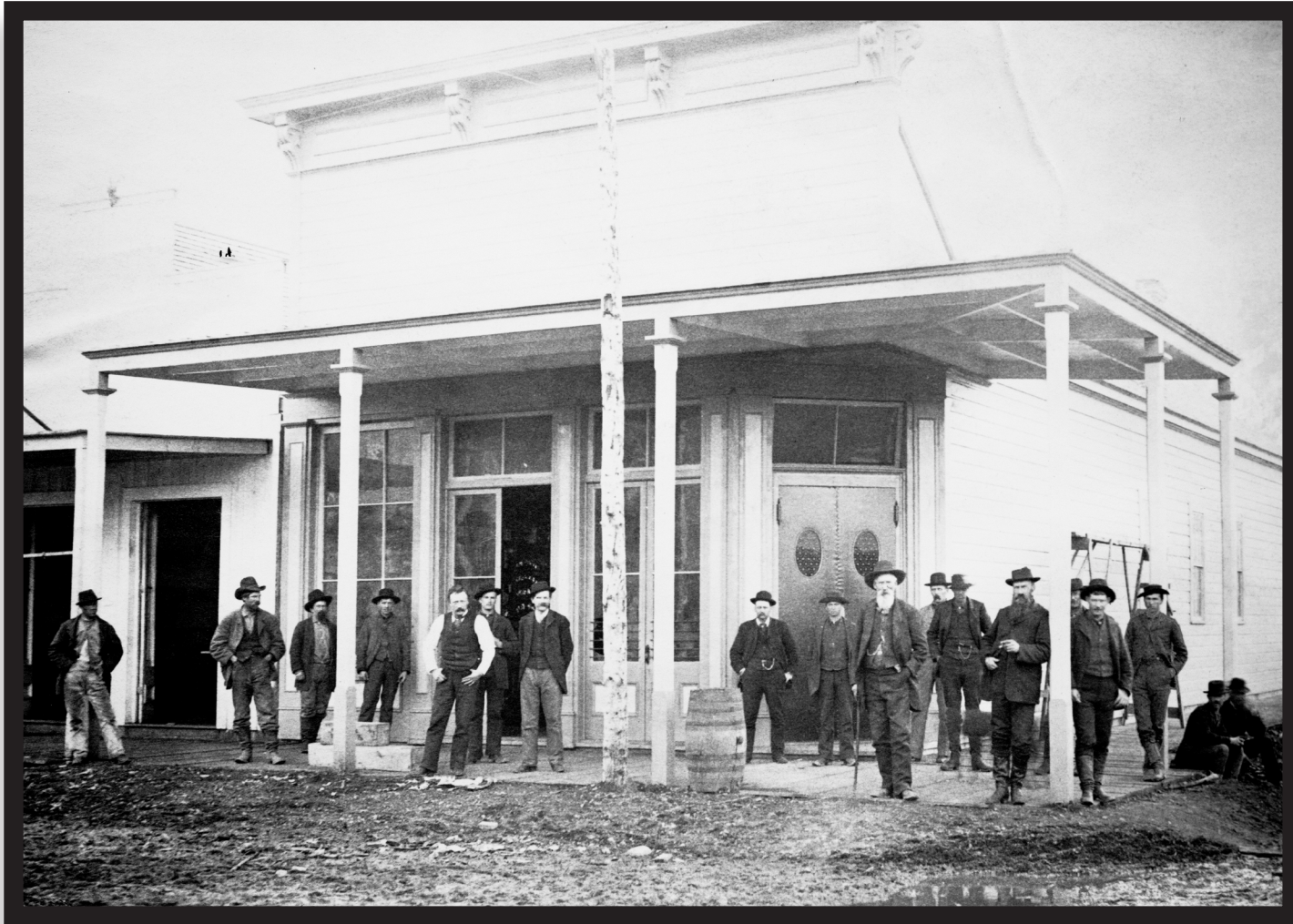
F 00796 / JOHN ANDERSON SALOON, KETCHUM BAKERY, AND CHOPHOUSE / 44" x 31"