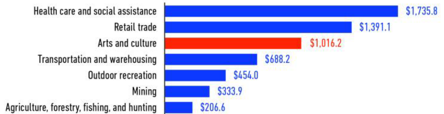
Value added to U.S. GDP by selected sectors: 2021 (in billions)