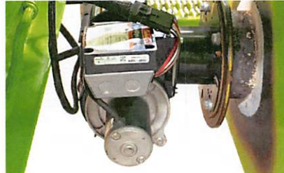
340,000 BTU Diesel Material Tank Burner