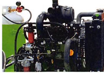
19 HP Isuzu Tier IV Diesel Engine