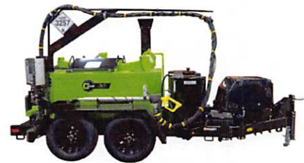
M-Series Melter Applicator 150 / 230 / 410 Gallon Units Available