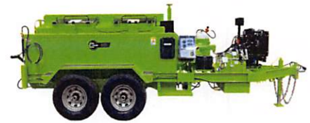
ME3 350 Gallon Mastic Melter Applicator