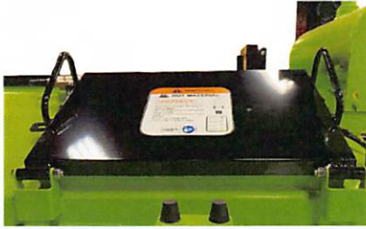
58 Inch Loading Door Height