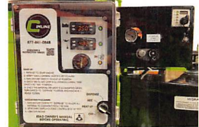
Single Switch Automated User Controls