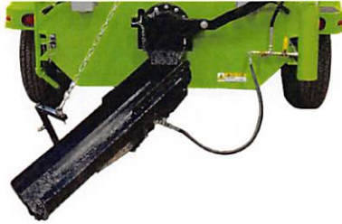
Wide Reach Propane Heated Chute