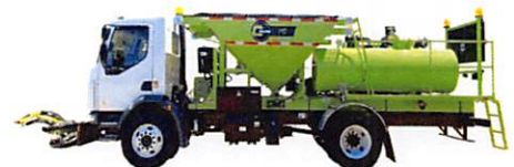
P5 One-Person Patcher with DuraPatcher™ Technology