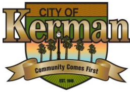
EXHIBIT 'A-1' REQUEST FOR QUALIFICATIONS