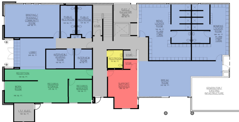
BLDG. A – 1ST FLOOR MAIN BUILDING 3/16" = 1'-0"