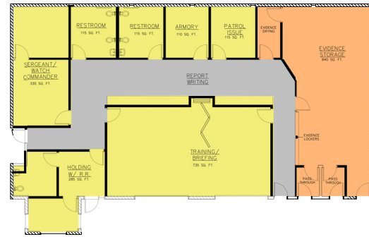
BLDG. B – FLOOR PLAN 3/16" = 1'-0"