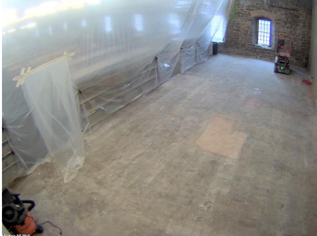
Future offices with the carpeting removed.