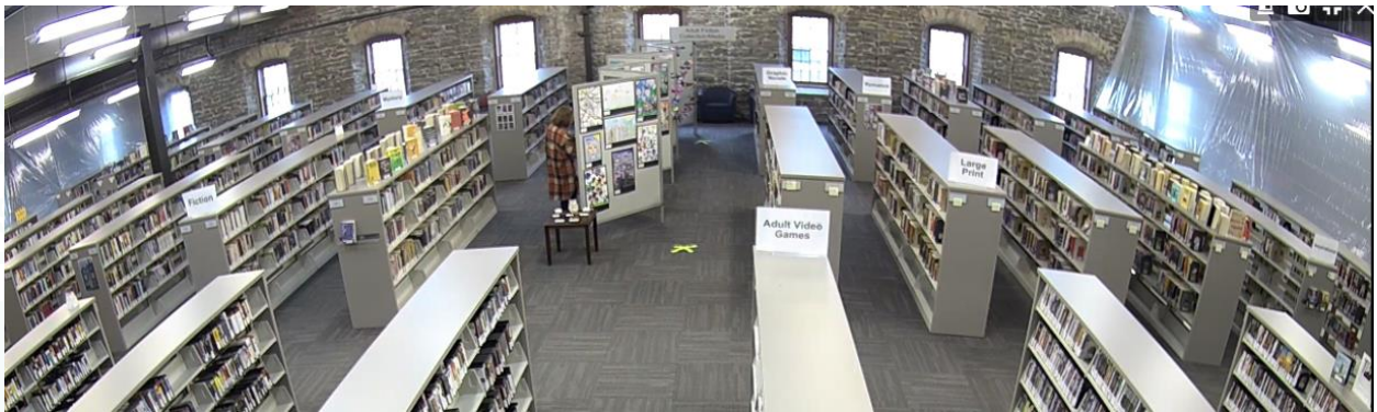
A view of Adult Fiction with the dust barriers on the left and right.