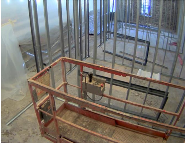
Framing in the office area already!