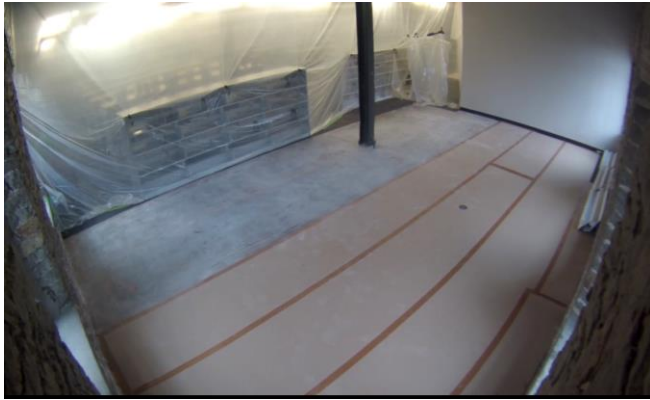
Future meeting room with partial carpet removal and carpet protection applied.