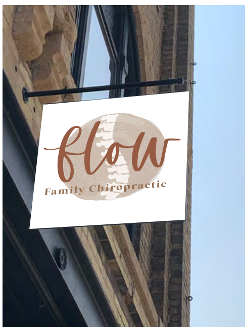
22"x22" Dibond Sign 2-sided with Mounting Pole