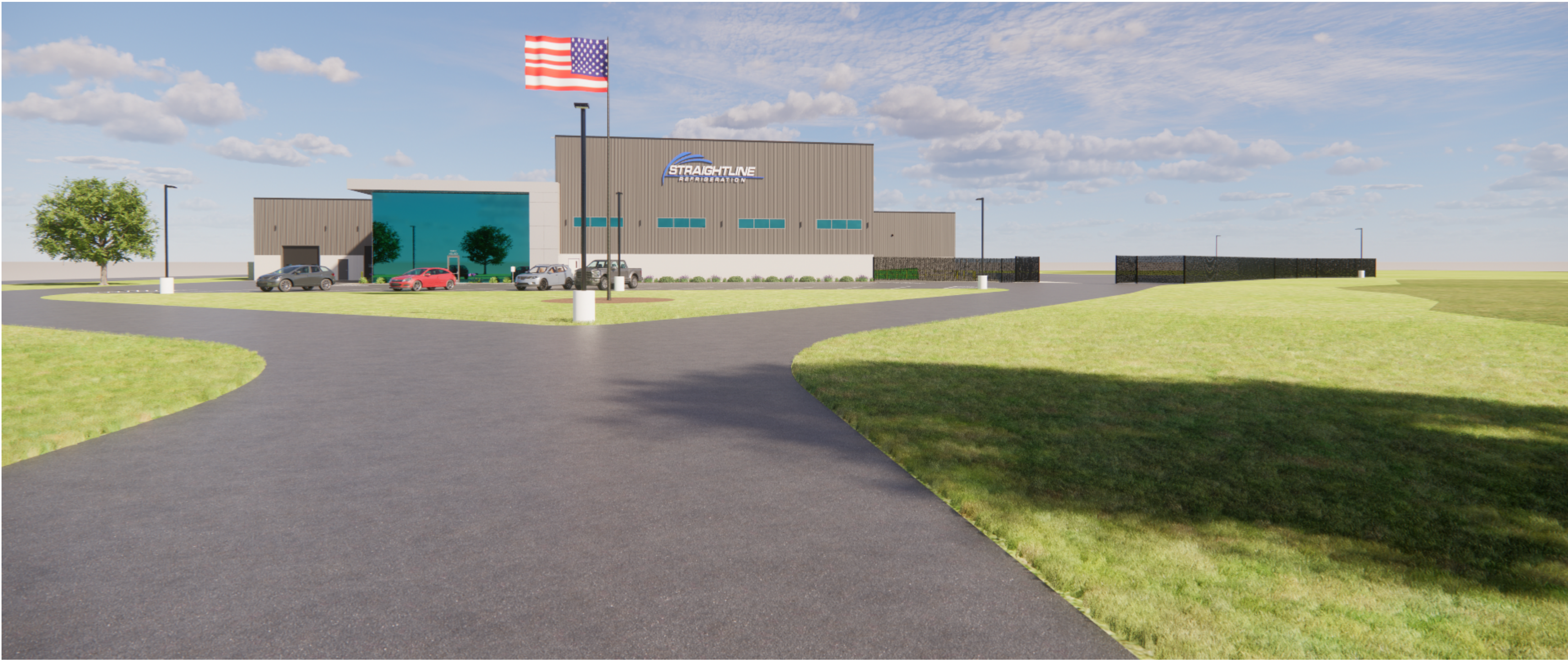
1 SITE RENDER (FRONT DRIVEWAY) 1/16" = 1'-0"