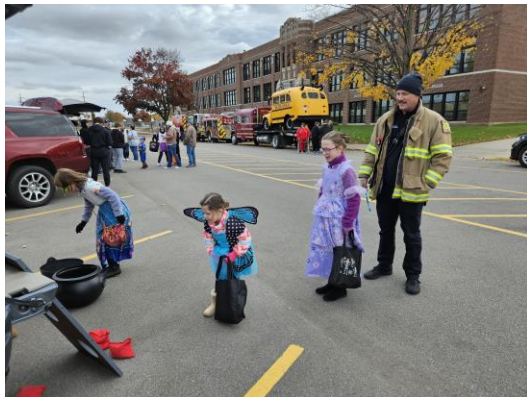
Fig 3. Trunk or Treat attendees taking turns. friends.

This year we participated in the Women's Auxiliary Trunk or Treat at River View Middle School. The KPL T-rex made an appearance, encouraging all attendees to try their luck with our spooky-themed beanbag toss. Everyone walked away a winner!