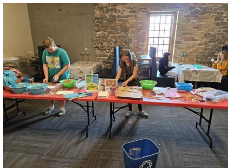
Fig 2. Tweens at the craft station