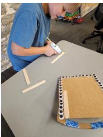
Fig 1. Working with hot glue

Kaukauna Public Library hosted our first-ever Comic-Con at the end of September. I have dreams of growing this event into something spectacular for our community! We only had 15 attend our 4-hour event, but that will not stop Kaukauna Public Library! Bigger and better for next year!