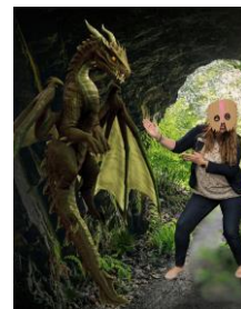
Fig 3. A strange adult