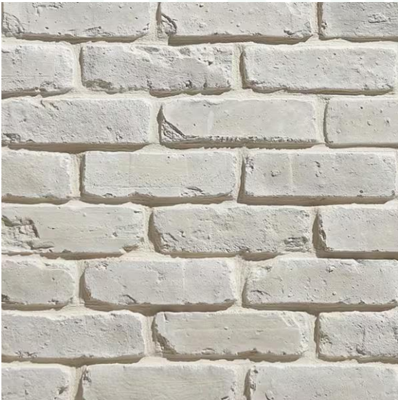
White Style Brick