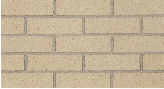
Cream Style Brick

For other materials more variety in color is acceptable, with a preference for natural, neutral colors. Blacks, dark grays, neon, and excessively bright colors are not considered acceptable. Some examples of preferred colors are shown below; however, this is not an exhaustive list of acceptable colors.