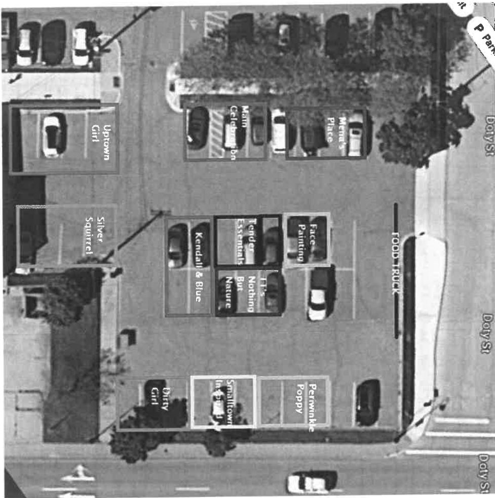
Last Years Mock-Up Vendor Map