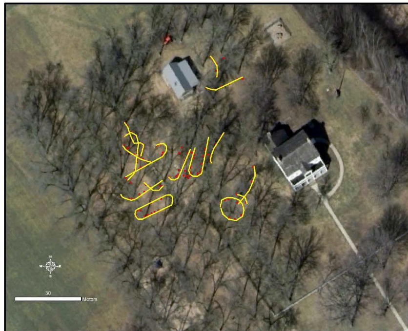
Figure 2: General area of excavation based on excavations done in 1999.