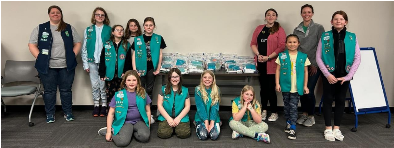
Girl Scout Troop 2444 poses with the hygiene bags they assembled for the Kaukauna Library Little Free Pantry

handwritten card with a positive message.