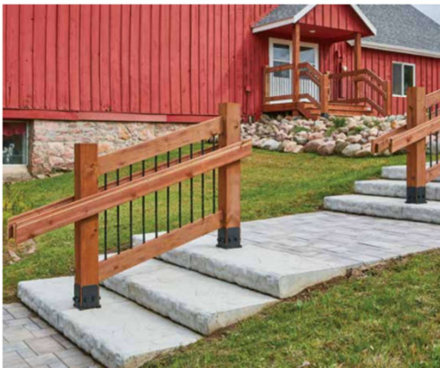
Oversize Landscape Step Units – GRAY color