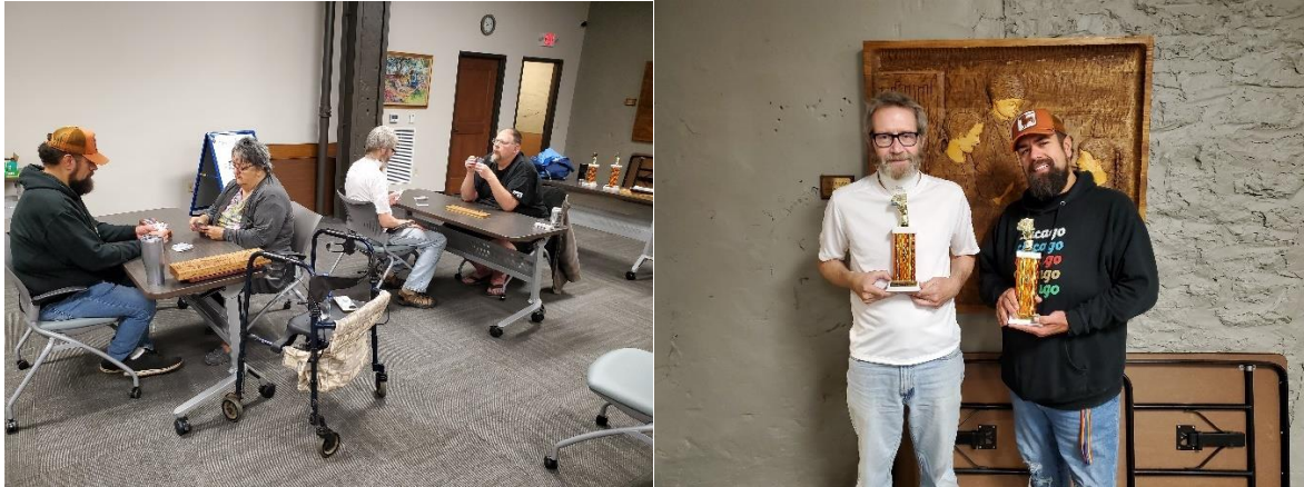
Patrons playing cribbage (left). First place winner on the right, second place on the left (right).