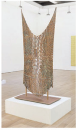
Michelle Grabner Untitled