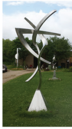
Bruce Niemi: Power of Three II