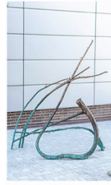
Todd Erickson: Still Listening