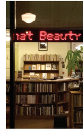
Paul Drueke: Sign of the Times