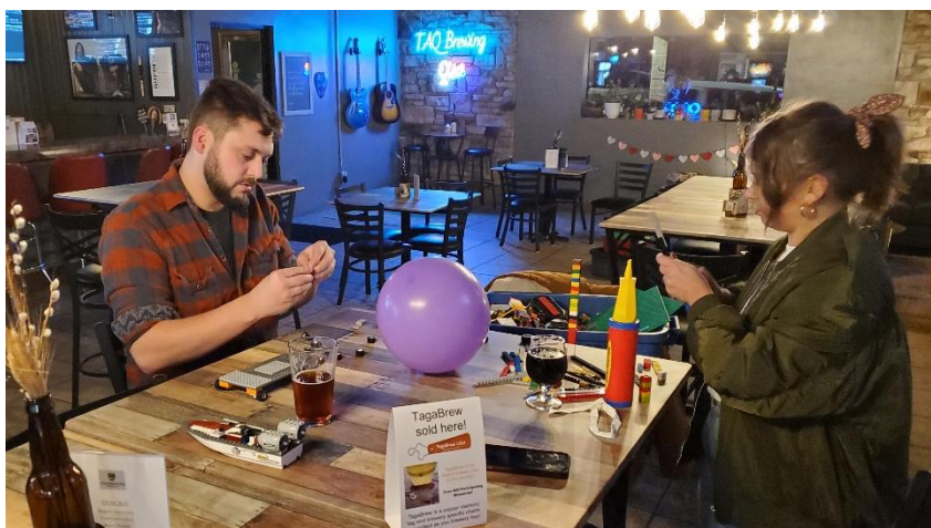
Two participants building a balloon-powered Lego car at TAQ Brewing.