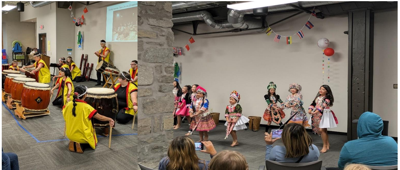
Oshkosh Taiko drumming (left) and Nkauj Zai Dance Academy dancing (right)!