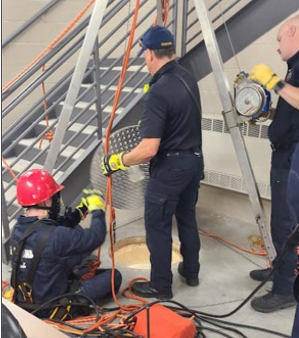
Firefighters training on safely entering a confined space to ensure responder safety